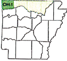
Plate OH-1 (Ozark Highlands)