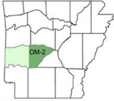
Plate OM-2 (Ouachita Mountains)