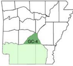
Plate GC-4 (Gulf Coastal Plain)