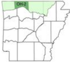
Plate OH-2 (Ozark Highlands)